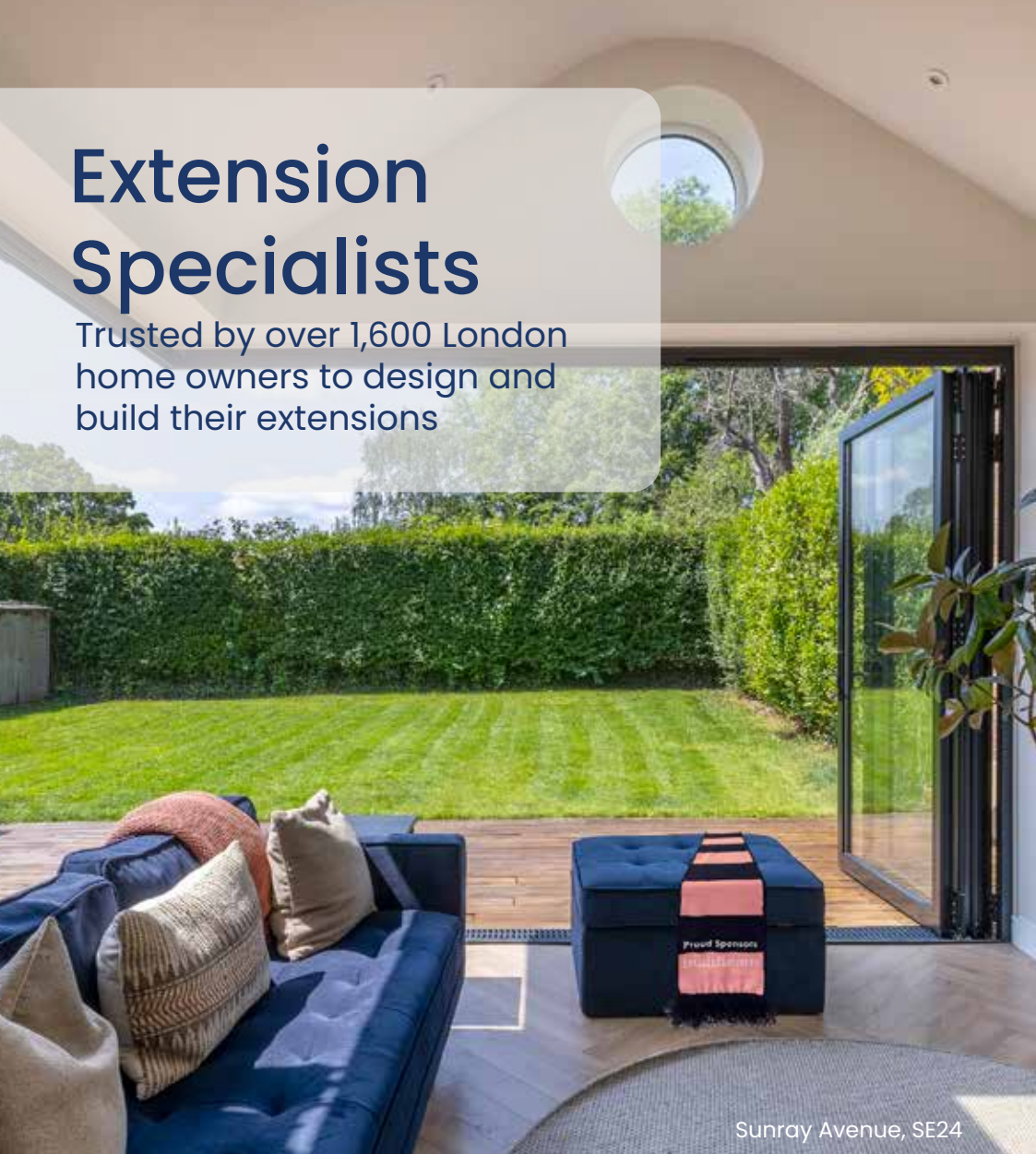
Sunray Avenue, SE24

Trusted by over 1,600 London home owners to design and build their extensions