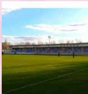
■ Club de Fútbol La Solana, España.

I've travelled about a bit! I grew up playing for Charlton and London Girls. I then played at the University of Nottingham. After that I played at Leicester United, Leyton Orient, London Bees, Lewes, and AFC Fylde. I then spent two seasons