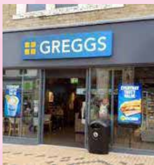
■ HUDDERSFIELD TOWN CENTRE YESTERDAY